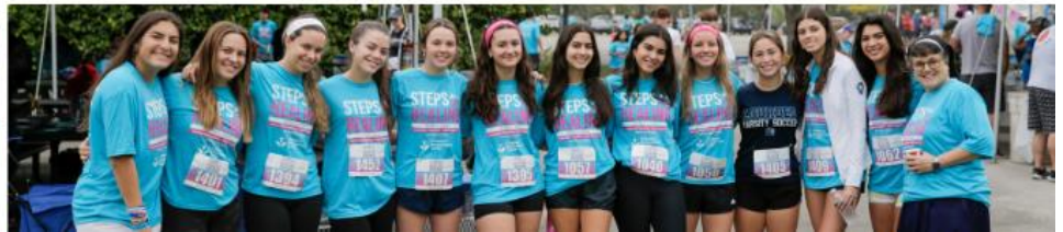
Participants by Age